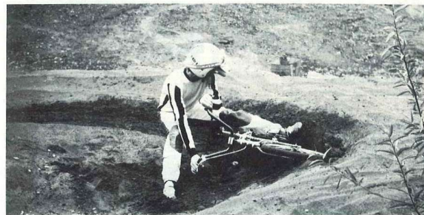
This machine loves berms ... especially on tight turns.