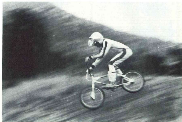
At speed is where the WEBCO Pro really handles. Its only limits are how fast you dare to take it.