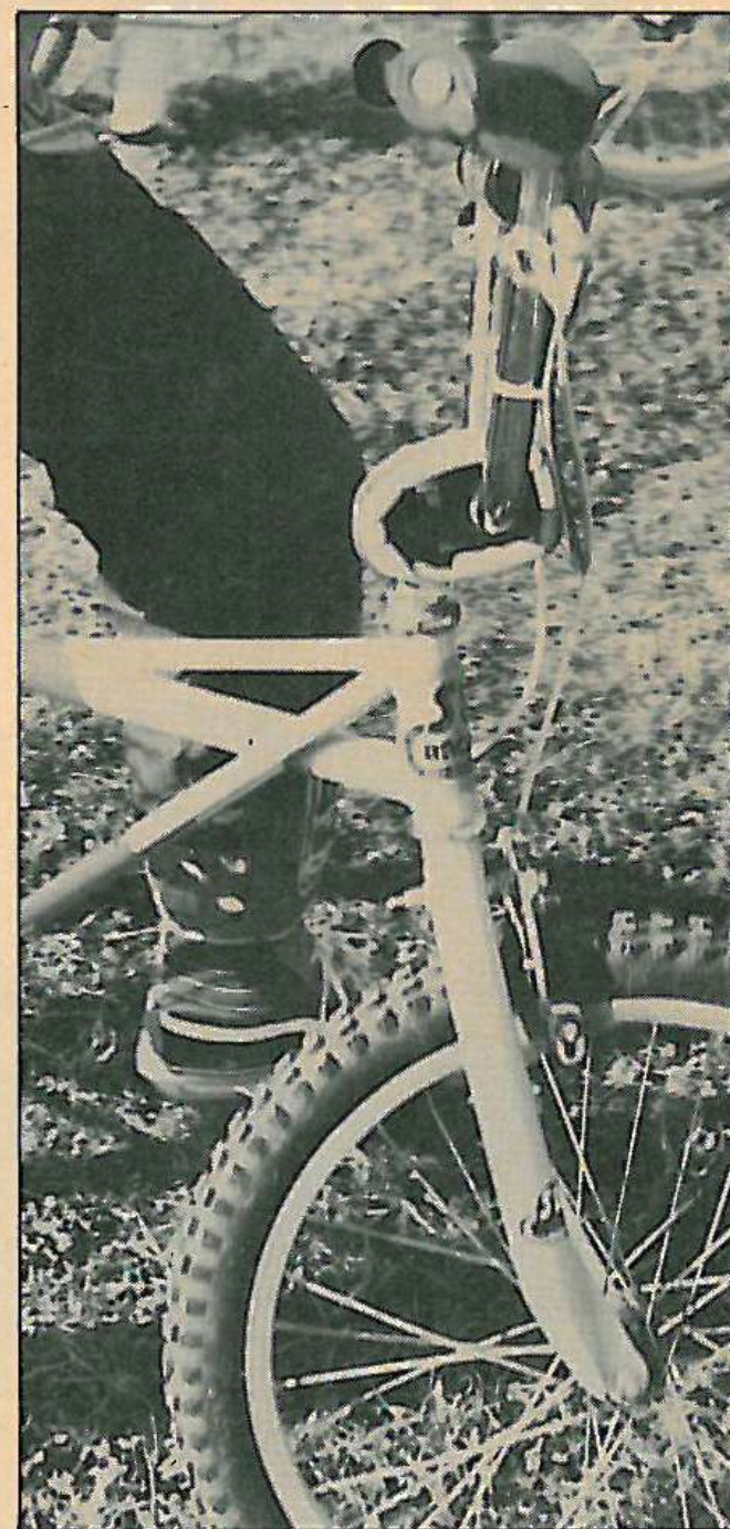
This has got to be the strongest front end in existence, bar none! Note the heavy tube triangulation at the steering head. Forks are lightweight SE "Landing Gear."

DISTRIBUTOR SE Racing 1667 E. 28th St. Signal Hill, California 90806