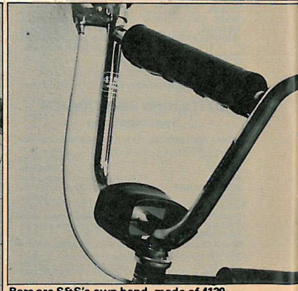
Bars are S&S's own bend, made of 4130 chrome moly. Under the padding is a solid Tuff-Neck stem.