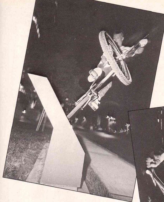
An easy lesson in street schralpin': 1) Find the Dean Witter building in Santa Ana. 2) Notice the transition of the sign. 3) Bunny hop up it. 4) Perform kick-turns on Dean's name or use it as a launch ramp. Or both.

"The 800 PXL will improve your racing tons. Compared to its predecessor, the 800p, the frame has gone through moderate changes. The bottom bracket was lowered and the front triangle lengthened. It still has the traditional Red Line 5-inch, flanged head tube, but with a DK upside-down cruiser stem, the bars won't be too