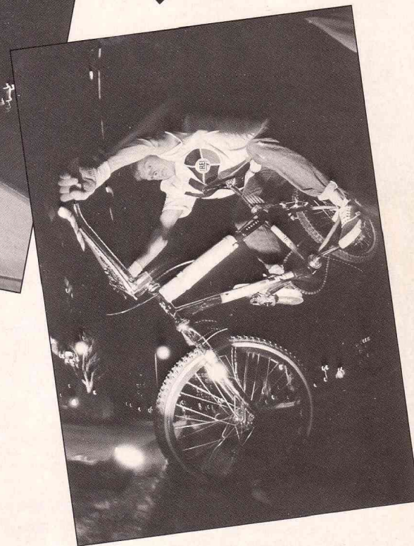
Lew once wrote, "Never forget your roots." Nobody but Fuzzy does curb endos anymore. Maybe after this, they'll make a big comeback.

high. Handling on the PXL is exceptional—slow to medium. Follow me and we'll set you up."