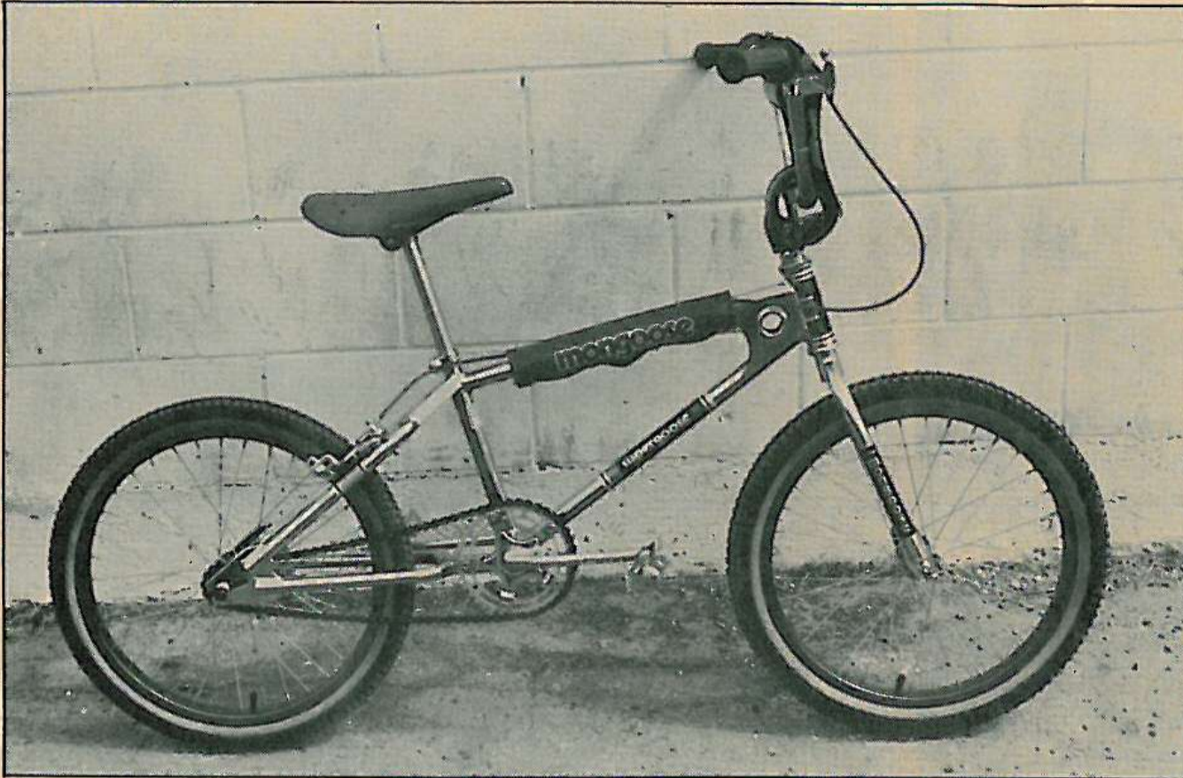
The Supergoose II is the latest in a long line of good bikes from Mongoose. At $300 a copy, it's a good bargain.