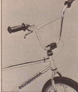
Up front the Laser Lite has everything you need to do the deed: 4130 chromoly bars, SunTour alloy stem, Tech 3 lever and SunTour Head-Lock-Up. The only weak places on the whole bike are the OGG vinyl "skin-eater" grips and the not-up-to-par headset. Other than that, head for the track!

of our test. In other words, the fun part. On the track the Laser Lite again welcomes the bigger rider with open arms. Power position is set up for riders over five feet tall up to about six feet. Normally we don't find that wide of an ergonomic range on bikes we test, but the Laser Lite seemed to feel good to just about any and all within that size category. While some smaller riders would have preferred a straight seatpost and different stem, most felt that they could learn to live with a Laser Lite in stock trim. And that's good news. It shows that the top-of-the-line Kuwahara is a comfortable and forgiving mount. Able to accommodate a variety of riders and riding styles. Originally we had thought that the Laser Lite would be a specialized, almost skittish-behaving pro bike with little or no time for anyone except its intended top-notch pilots. Instead, the Laser Lite proved to be a fast-paced yet mild-