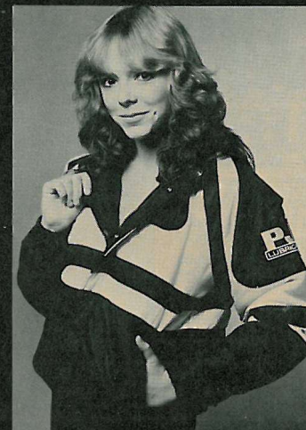
PJ1 Parkas are black in color with Yellow & White Stripes

Specifications: 100% Nylon. Polyester filled, elasticized waist and cuffs, double front closure, zippered side pockets, comfort padded collar, concealed hood, tailored design and fit. Send money order to avoid delay in shipping. Allow 3 weeks on orders with personal checks.