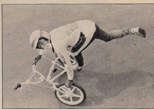
Flatland precision and grace were features of the Wind Styler. Balancing was easy, and the bike's large size didn't detract from its maneuverability.