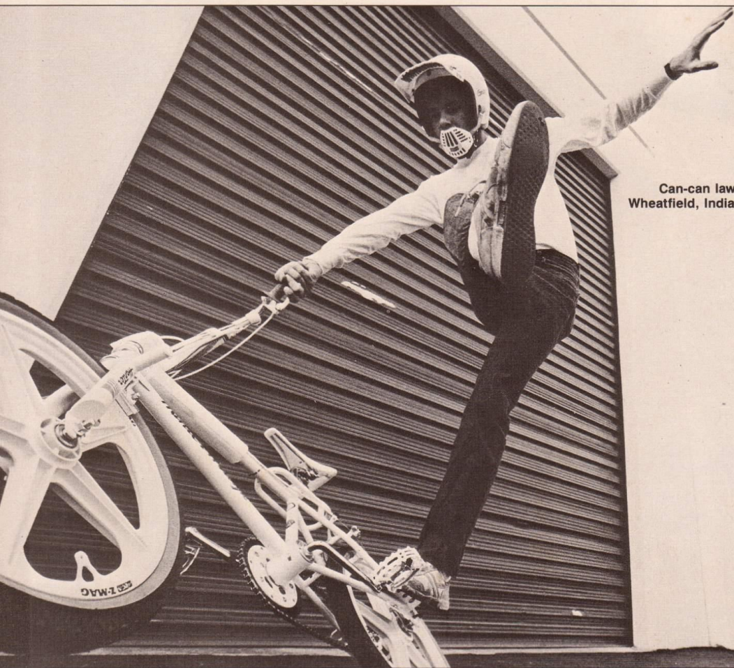
Can-can lawnmower, Wheatfield, Indiana style.