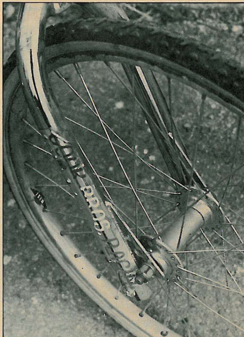
A close look at the Mini's wheels show just how trick they are. Rims are Nisi alloys with sew-up knobblies glued onto them.