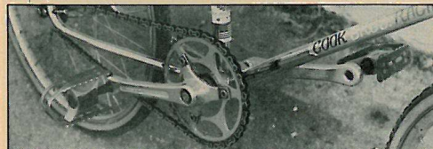
Crank is a very sano Shimano 600 with a three-leg spider to hold the sprocket. Chain is by Everest; pedals are Reedy's.