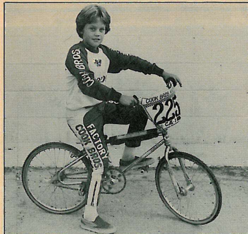
At 18 pounds wet, the Cook Bros. Mini BMXer has got to be the lightest in its class. It's the perfect mount for small guys.