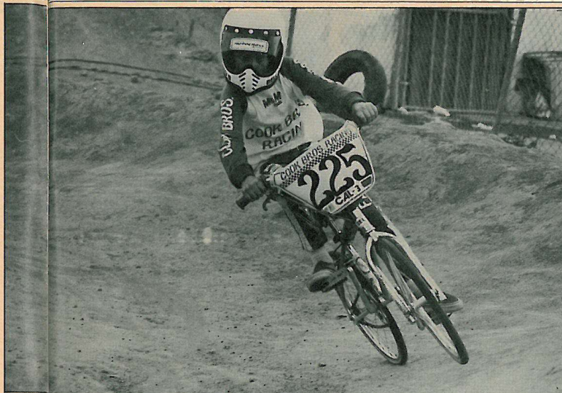
The Cook Mini is so light that even the little guys can whip it around the track with little problem. Hopefully it can take the worst that a track can dish out.