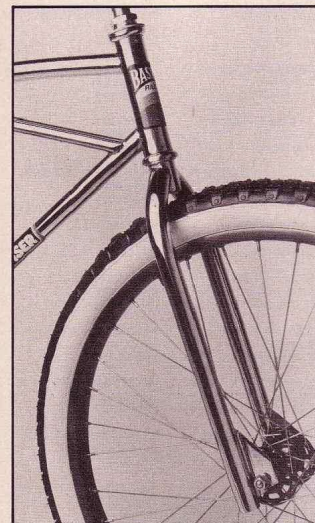
For those real hard lunar landings you'll be needin' some 105's to keep the Araya rims as true as they are blue. The chrome-moly forks are beefy suckers, treads are Kenda knobblies.

shinin' for many moons to come. But the finish is just the starting point (did you catch that little zinger?). From there Bassett has added their incredible rainbow graphics and a selection of bionic blue accessories. The boyz at Bassett use mild steel