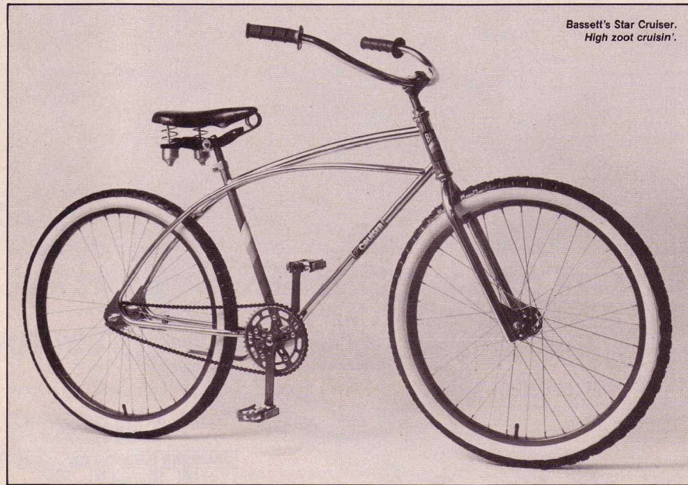
Bassett's Star Cruiser. High zoot cruisin'.