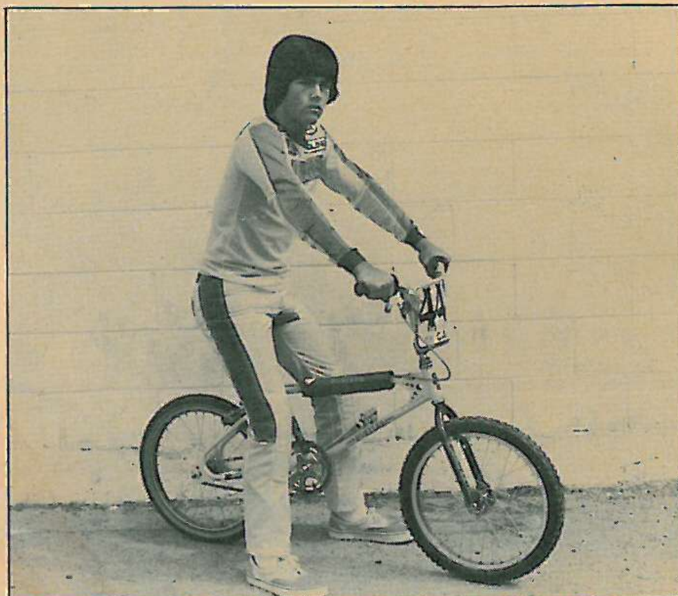
The Hustler Super Pro is a long wheelbase bike for bigger guys. Axle to axle is 37-1/2 inches. Check out the ventilated head gusset.